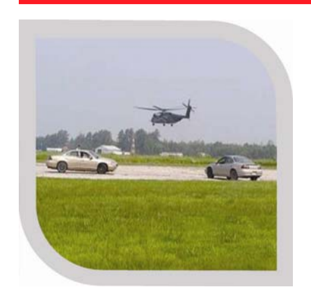
West Point, USA