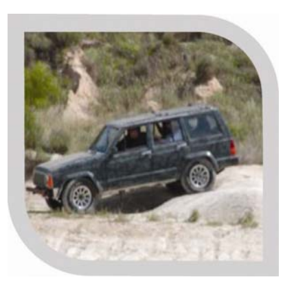
San Antonio, USA